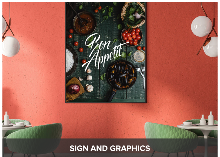
SIGN AND GRAPHICS