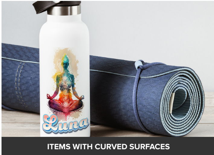
ITEMS WITH CURVED SURFACES