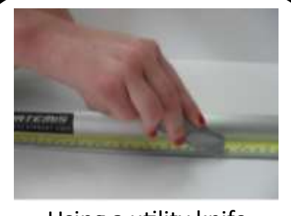
Using a utility knife