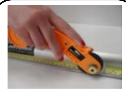
Using a rotary blade